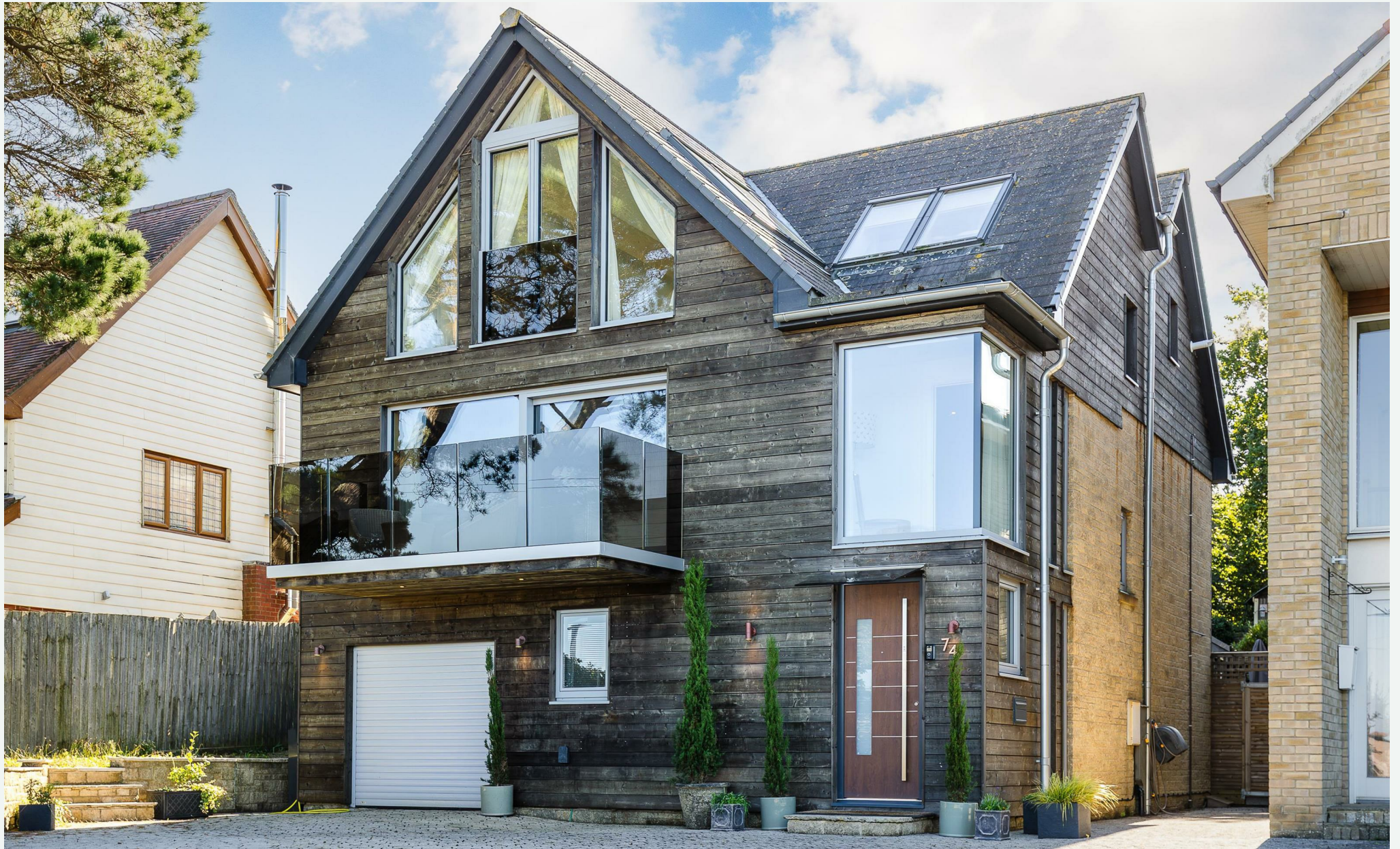
Larch House 74 Baring Road, Cowes, Isle of Wight, PO31 8DW